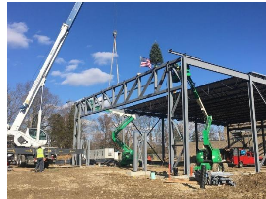
Performing Arts Center Exterior

Future plans will expand the High School and to build a new gymnasium for the Elementary school.