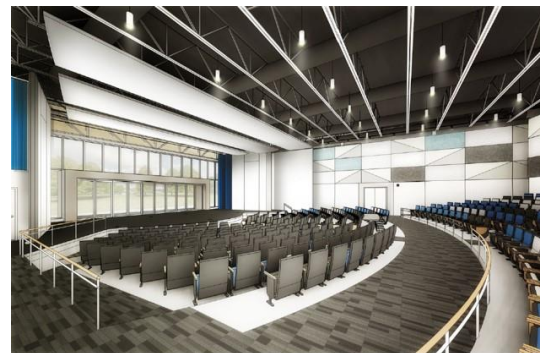
Performing Arts Center Interior